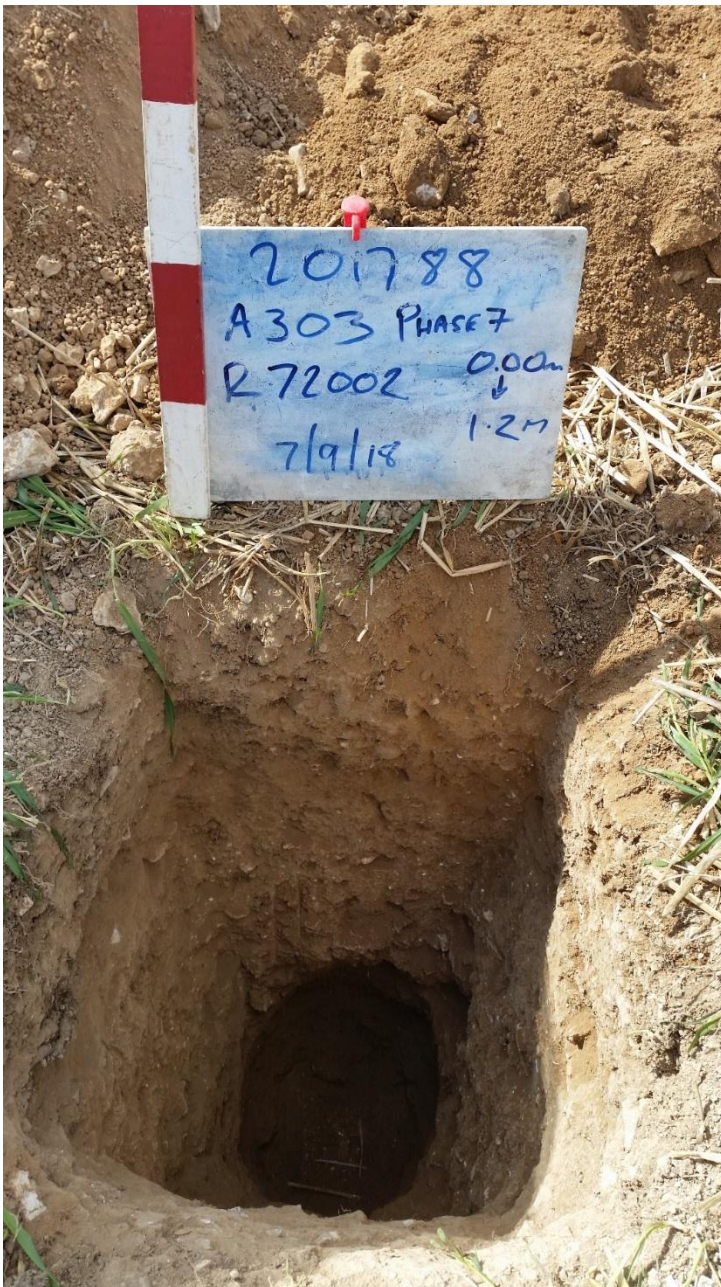
Plate 8-1. Inspection pit for borehole R72002